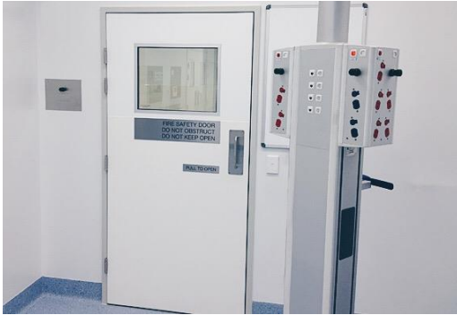
Lead Equivalent Glass Viewing Panel in lead lined door.