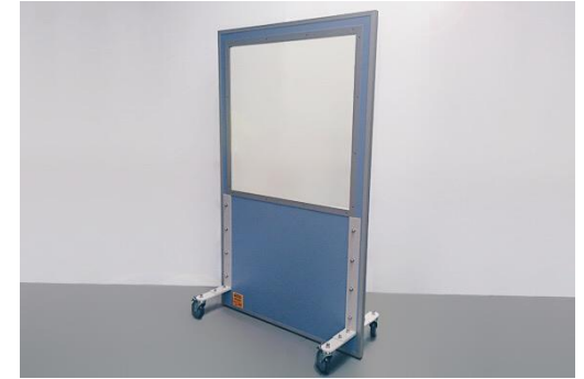
Lead Equivalent Glass Viewing Panel in mobile control screen.

Please note – Due to the irregularity of thickness of Lead Equivalent Glass over a given size, the application of film may cause some minor visual imperfections.