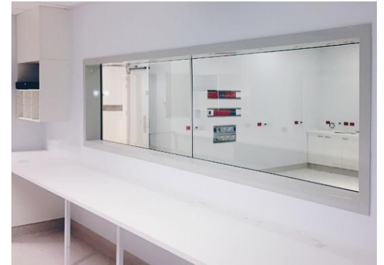
Lead Equivalent Glass Control Window